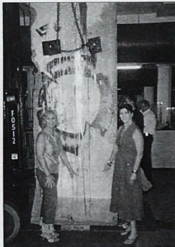
Berlin American High School's Berlin Brats Alumni Association wishes to thank all who donated to the shipping costs. Your generosity is sincerely appreciated.