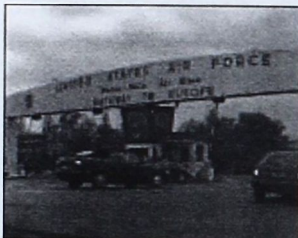
Main entrance to Rhein-Main Air Base, the "Gateway to Europe."

At Rhein-Main Air Base, Germany, school is out forever. Halvorsen-Turner Elementary-Middle School closed in June 2005 for the final time. There had been a school at Rhein-Main for over 50 years.