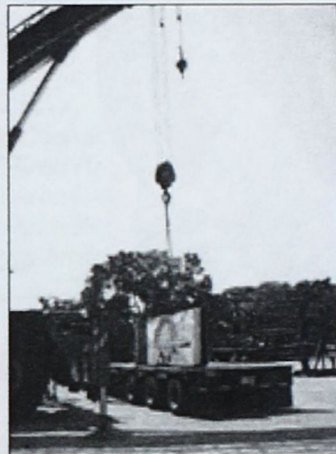
The Wall section is lifted by crane for transfer to a smaller truck.