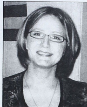
New Archive Associate