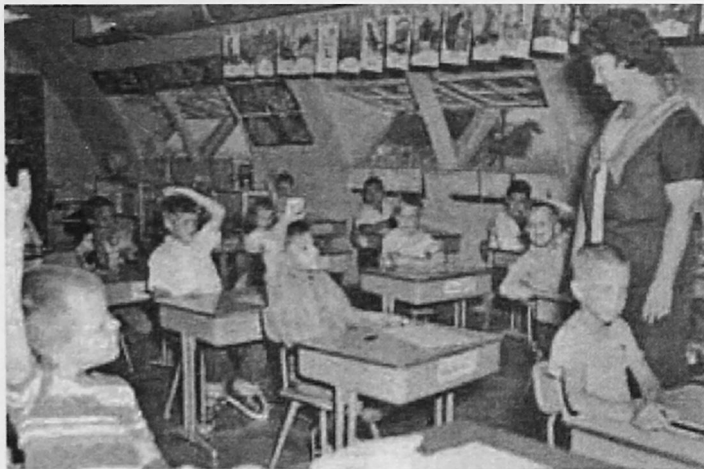
Many early DoDDS classrooms were in converted buildings like this one at Mercy ES, Okinawa, Japan. If you have photos you would like to share, send them to the AOSHS Memorabilia Archives, 704 W. Douglas, Wichita, KS 67203-6401